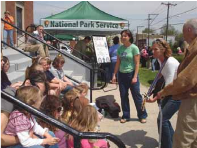
Earth Day Fun for Young and Old

All donations are tax deductible and if anyone would like to contribute, please contact Aimee Rist at 304.890.5794.