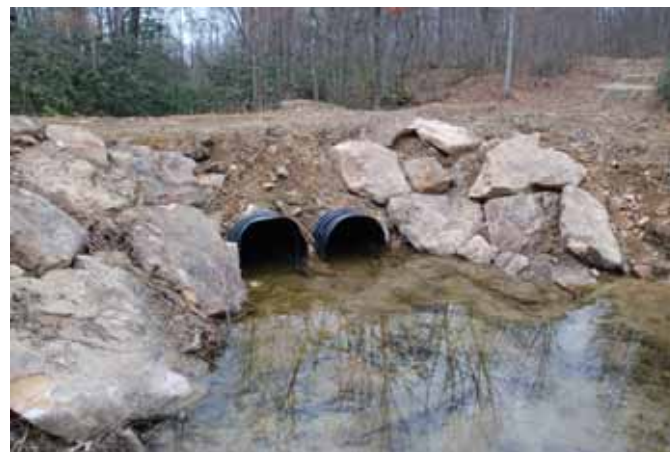
New Culverts Installed at WETS on Unnamed Wolf Creek Tributary

In addition to testing water upstream of the wetlands, WETS will enable students to learn about macroinvertebrates and other aquatic life. PAN used Stream Partners Grant funds and volunteer hours to help support this project.