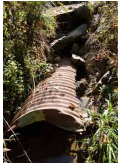
Old Culvert Replaced

The pond, nicknamed "WETS" (Water Evaluation Testing Station), will be the main sampling site to demonstrate the role wetlands play in keeping streams clean. Water testing stations will be located along the streams feeding the wetland, in the wetland, and where the wetland empties into Wolf Creek, allowing investigators to compare the wetland's effectiveness at filtering/enhancing desirable/undesirable water components.