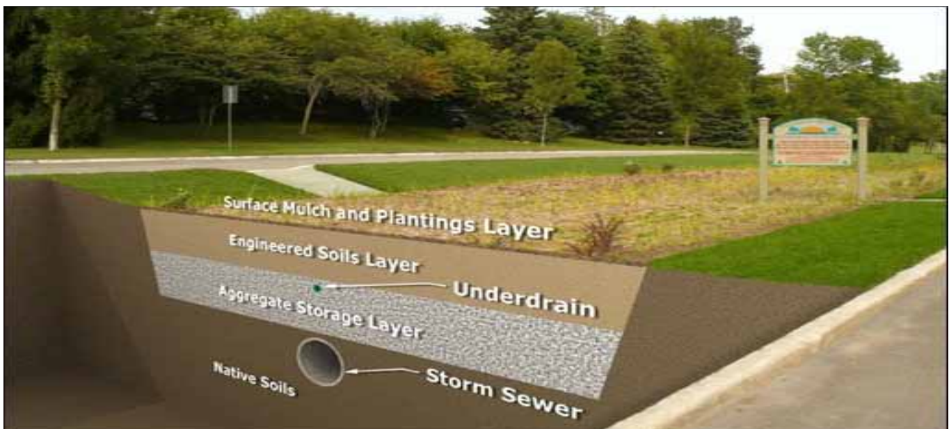
Sample Bioretention Cross Section

Go to our website www.plateauactionnetwork.org then the projects tabs for more information.