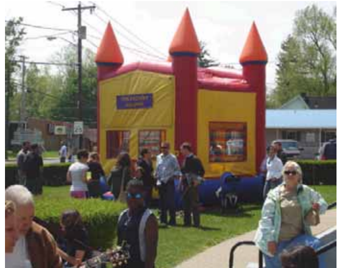
Earth Day Celebration 2010

Organizers of the Fayette County Green Team today announced that the 6 th annual New River Earth Day Celebration will be held Saturday, April 23 downtown Fayetteville (weather permitting) from 12:00 to 5:00pm.