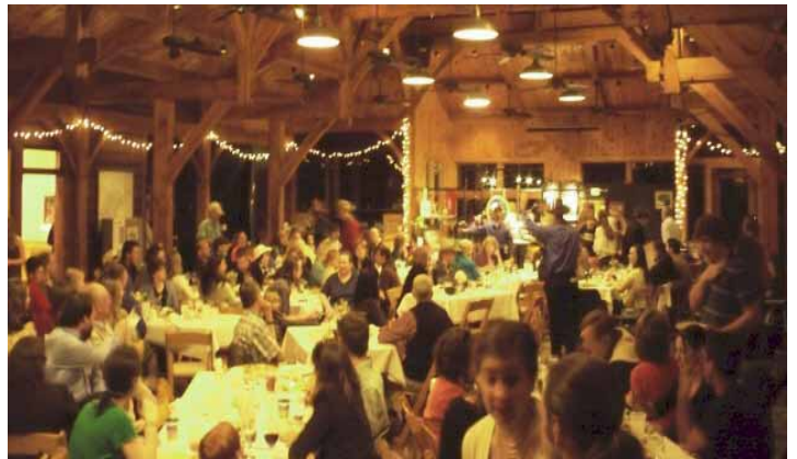
Some of Last Years Fun - Live Auction was a Big Hit